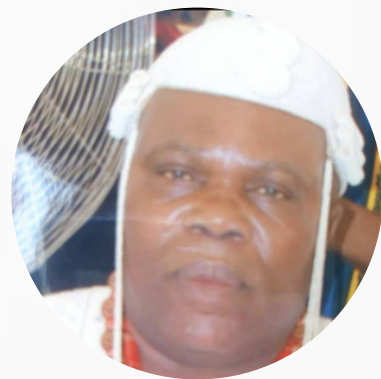
HRM OBA ADEBOWALE ADEKUNLE.. AGBOJU OF AGBAJE, OSUN STATE.