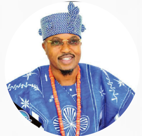
HRM OBA ABDULRASHEED ADEWALE AKANBI TELU 1. OLUWO OF IWO KINGDOM.