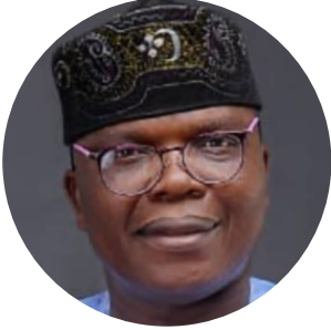
BARRISTER JOLA AKINTOLA.

TOPIC 1 :POSITION OF OSUN STATE MINISTRY OF ENVIRONMENT AND SANITATION ON CLIMATE CHANGE AND NATURAL DISASTER.