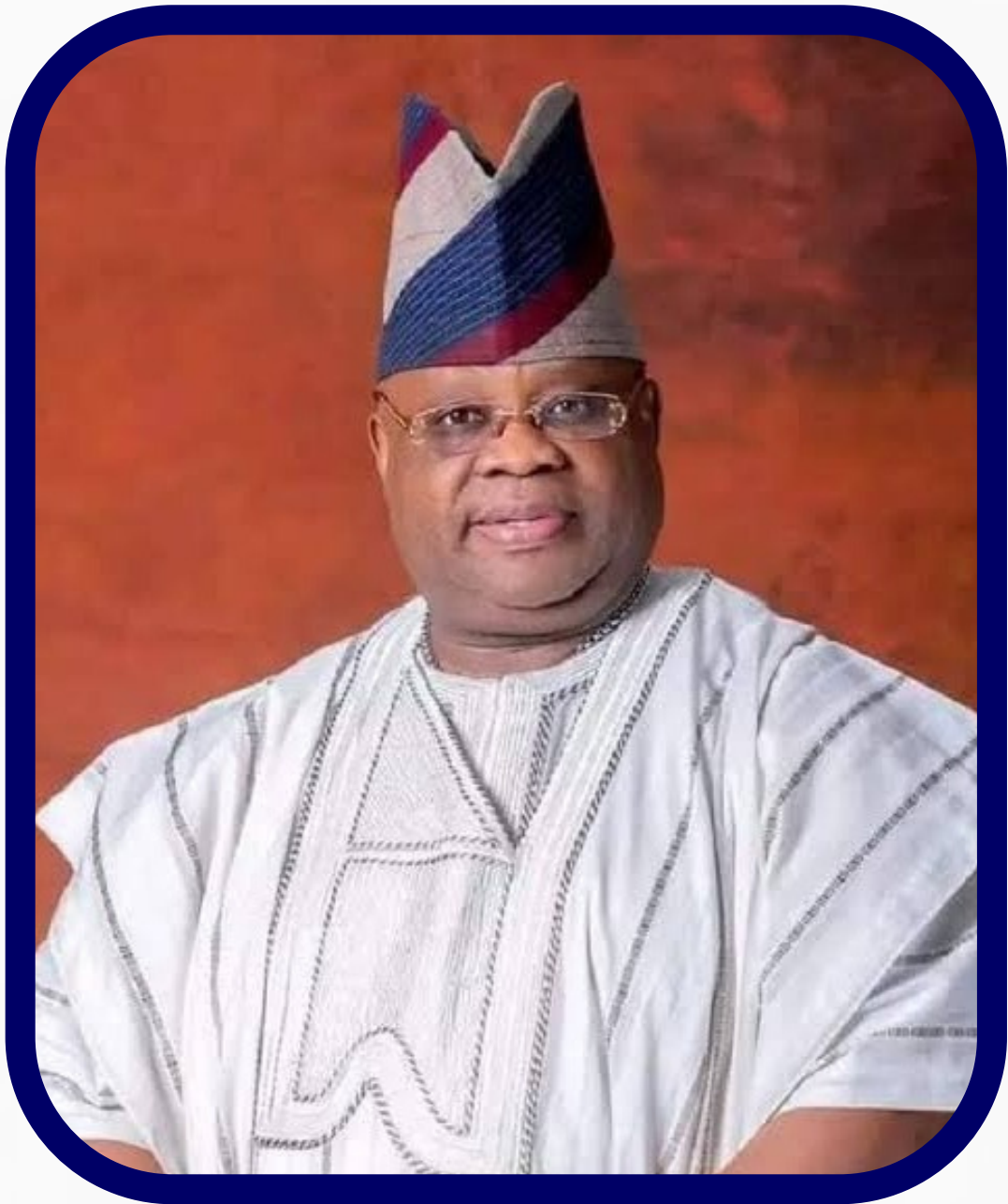
HIS EXCELLENCY SEN. ADEMOLA JACKSON NURUDEEN ADELEKE GOVERNOR OSUN STATE