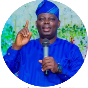
HON MAYOWA ADEJORIN

TOPIC 1 :POSITION OF OSUN STATE MINISTRY OF ENVIRONMENT AND SANITATION ON CLIMATE CHANGE AND NATURAL DISASTER.