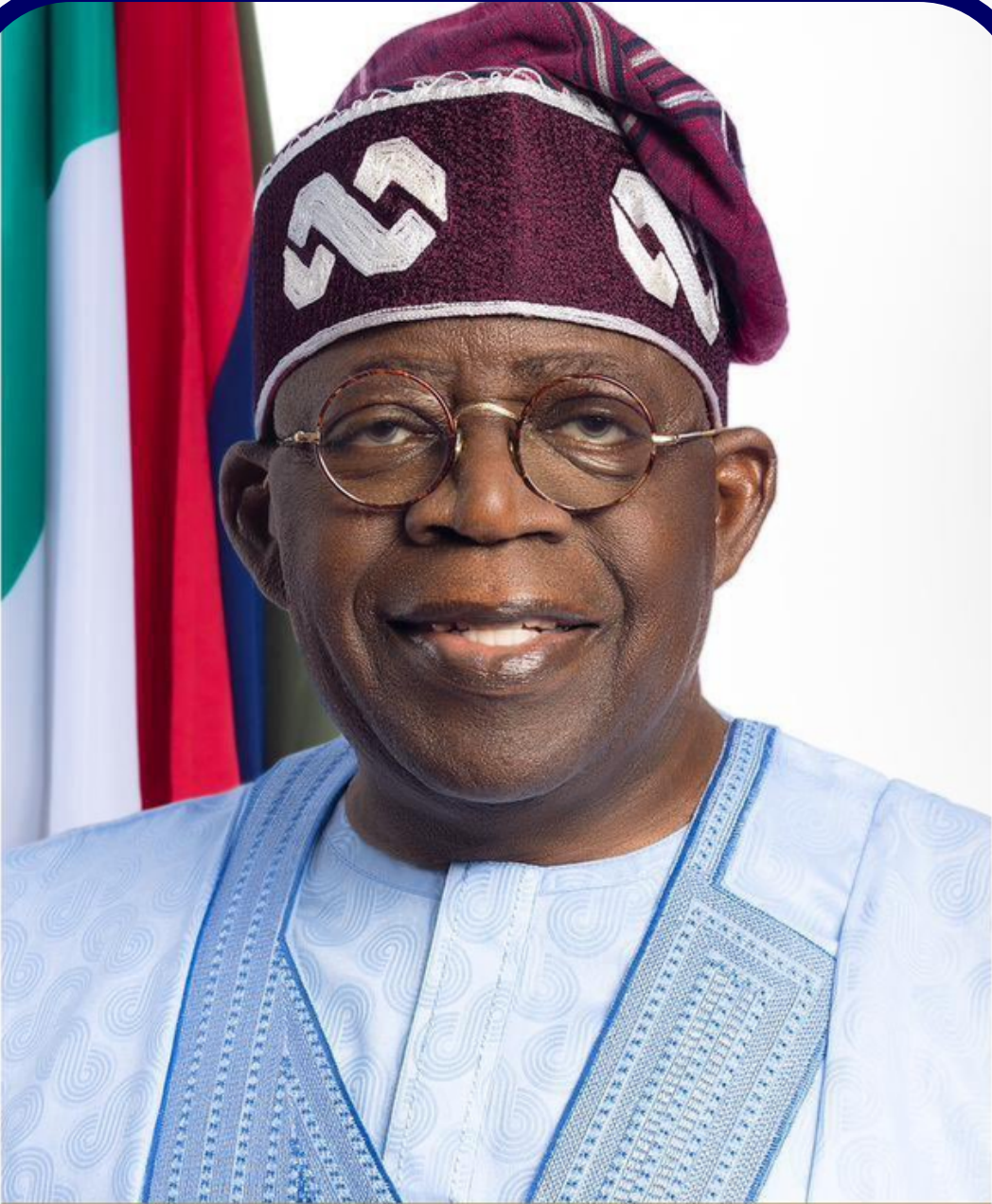
HIS EXCELLENCY BOLA AHMED TINUBU GCFR PRESIDENT, COMMANDER-IN-CHIEF OF THE ARMED FORCES FEDERAL REPUBLIC OF NIGERIA.