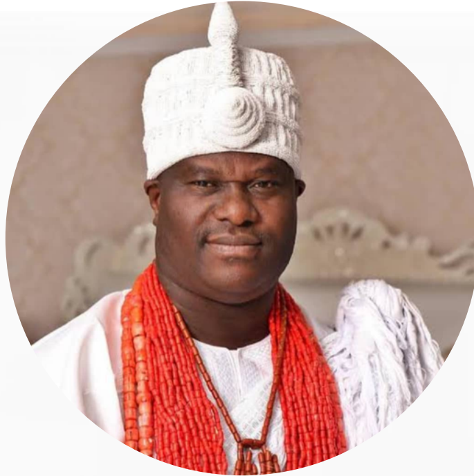
HRM OBA ADEYEYE ENITANBABATUNDE OGUNWUSI..OJAJA OONI OF IFE,,OSUN STATE.